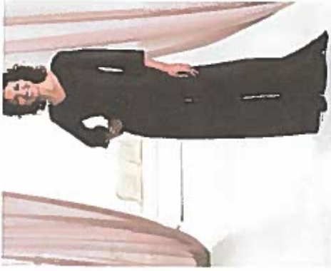
Knit Palazzo Pants