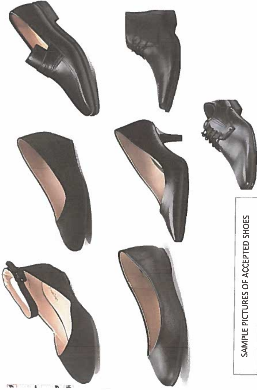
SAMPLE PICTURES OF ACCEPTED SHOES

Shoes should not have metal or colored embellishments.